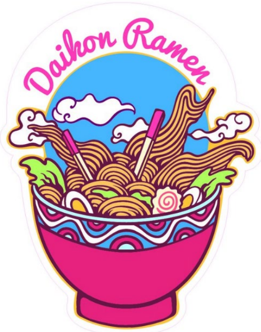
Simple Image (recommended)

Simple images with bold colors are best. If you’re not printing with white inks, then any white area in the graphics will be the holographic film showing through. Do not use graphics with special effects, i.e., shadows, gradations, etc. Below are examples of Simple vs. Complex Images.