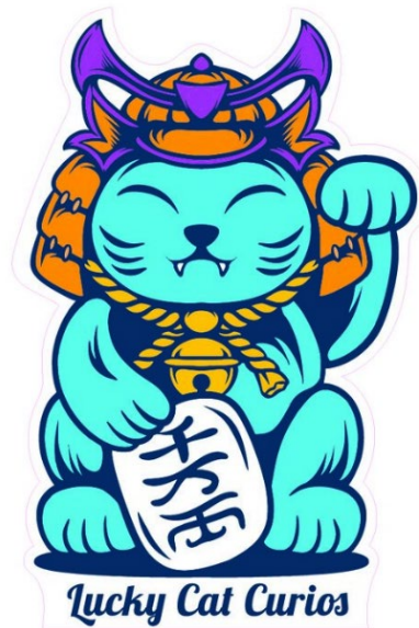
Simple Image (recommended)