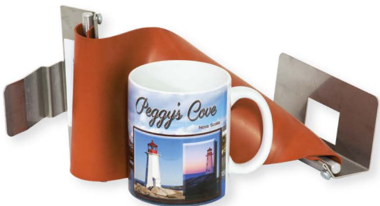
4" Straight Mug Wrap (shown with 11oz mug)

These ovens use a proprietary heating and recirculating airflow technology that allows you to produce the highest quality product possible. With specifically engineered and positioned heaters, and an advanced, highly efficient recirculating air flow system HIX has been able to reduce the temperature variation in the oven chamber to within 10°F of the set process temperature. This will satisfy the curing requirements of even the most demanding and unforgiving substrates. The accurate temperature profile, the large door openings, the advanced cooling system located at the exit end of the conveyor, and the durable Stainless Steel conveyor belt give you the best sublimation oven available on the market today.