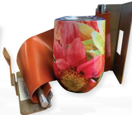
Custom Mug Wrap (shown with curved wine mug)