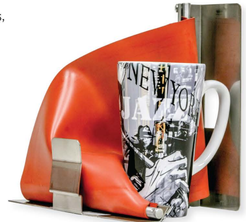
6" Tapered Mug Wrap (shown with 17oz latte mug)

Compatible with standard ceramic 17 oz latte mugs or porcelain eco-tumblers.