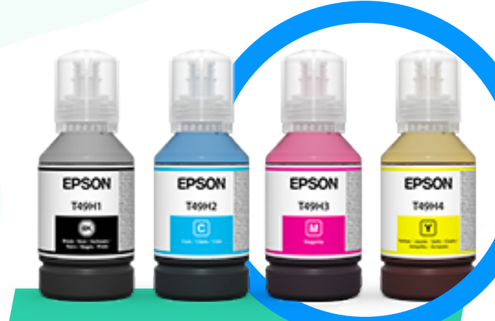
CAD/technical printers such as the Epson SureColor T3170X use low cost ink bottles instead of cartridges.

And finally, there's the ink container itself. Generally, the bigger the ink capacity, the better the value. Ink cartridges in many Epson CAD/Technical printers range in sizes from 50 mL up to 700 mL. While most of us are familiar with ink cartridges, there are also high-capacity SuperTank refillable ink tank options which can offer a considerably lower cost per mL.