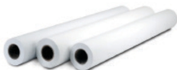
HP Production Satin Poster Paper, 3-in Core for HP PageWide Technology For the latest ICC profiles/paper presets, please visit HPLFMedia.com/paperpresets .