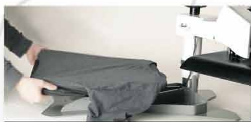
Dress / Thread from the back (Shirts right-side up!)

Our exclusive SuperCoil-Microwinding™ heater technology guarantees perfect uniform heat to the edge - outperforming and out heating all others, with Lifetime Warranty!