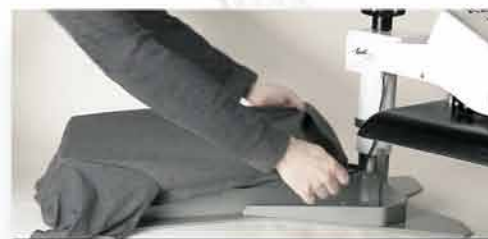
Dress / Thread from the Front (Screenprint style Quick-load)

ALL-Thread™ bottom tables allow for dressing garments, bags, and other hard-to-press bulky products around the table. Instantly interchangeable sleeve, youth, bag platens, & custom sizes are available!